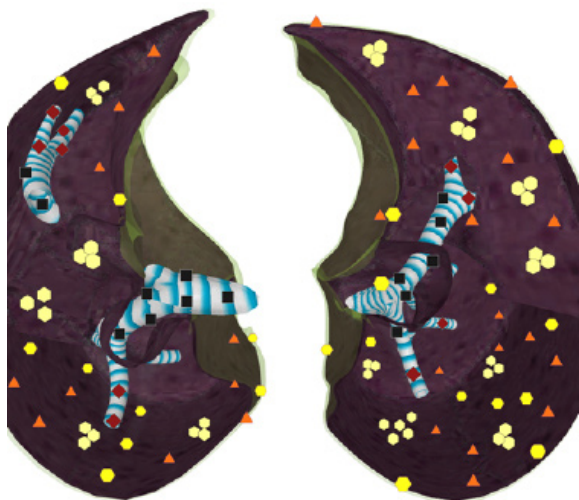
Pic. 3. 3D NLS-graphy. Emphysema, infectious bronchiolitis and obliterating bronchiolitis.