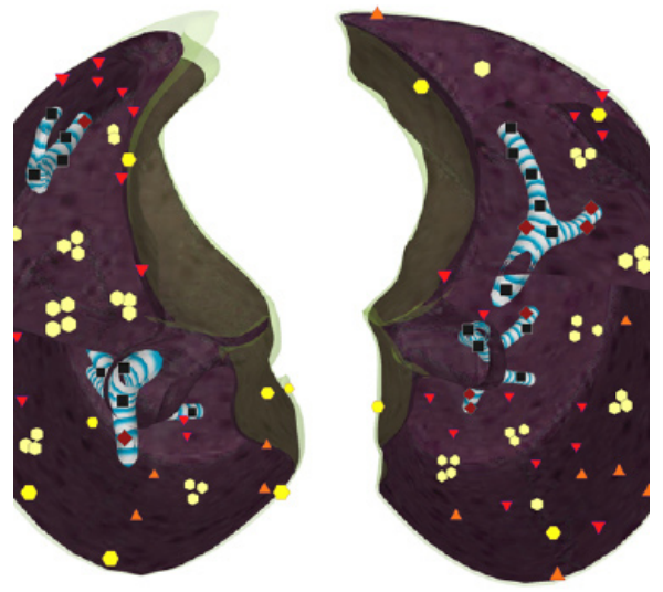
Pic. 2. 3D NLS-graphy. Obliterating bronchiolitis, bronchitis, bronchiectasia. Multiple air traps, affection of bronchi walls. Hyperchromogenic bronchi against the background of achromogenic air traps.