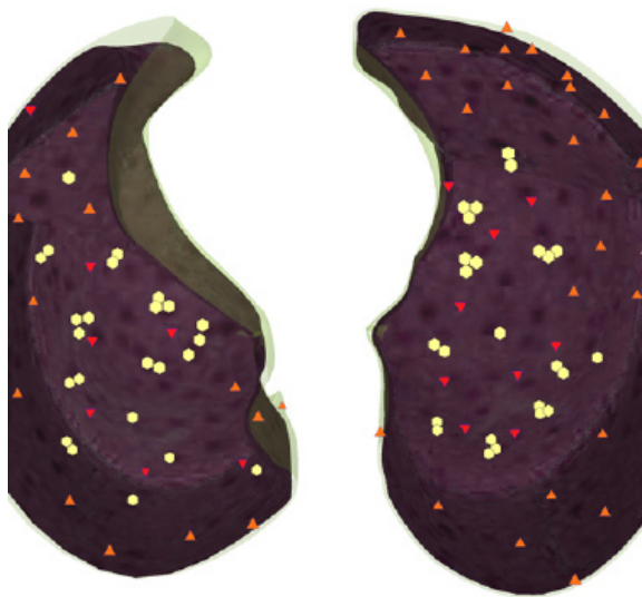
Pic. 1. 3D NLS-graphy. Intralobular and paraseptal bullous emphysema. Multiple achromogenic air cavities of various sizes, mainly without visible walls against unchanged parenchyma.

4. 3D computer NLS-diagnostics should become a method of choice in ray diagnostics of COPD.